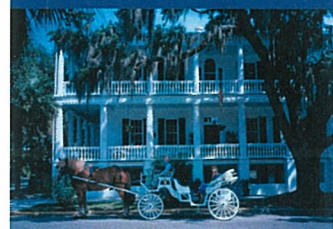
You'll feel like you've traveled back in time

Departure: Meijers, (by Garden Center), 3360 Tittabawssee, Saginaw, MI @ 8 am then Meijers, 1350 West Lake Lansing Rd, East Lansing, MI