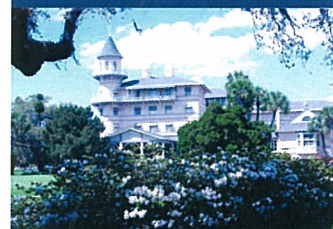
Jekyll Island - Georgia's elite coastal barrier island