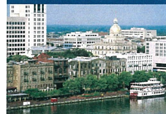
Savannah - the "Belle of Georgia"