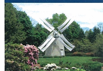
One of Cape Cod's many Windmills