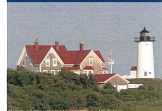
Lighthouse overlooking Vineyard Sound