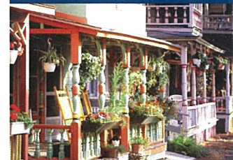
Historic seaside towns of Hyannis and Sandwich

Day 7: Today, after enjoying a Continental Breakfast, you will depart for home... a perfect time to chat with your friends about all the fun things you've done, the great sights you've seen, and where your next group trip will take you!