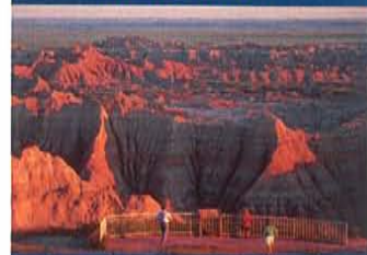
Spectacular Badlands National Park