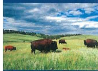
Wildlife enhances the pristine Black Hills