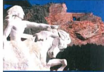
Crazy Horse Monument to be 10x the size of Mt. Rushmore