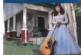
Spectacular Loretta Lynn's Ranch.