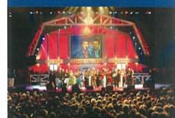
Famous Grand Ole Opry.