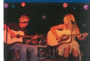
Nashville Nightlife Dinner Theater.