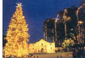
Stand where history took place at the Alamo

Day 9: Today, after enjoying a Continental Breakfast, you will depart for home... a perfect time to chat with your friends about all the fun things you've done, the great sights you've seen, and where your next group trip will take you!