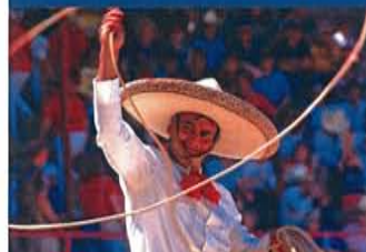
Enjoy the sights and sounds of San Antonio