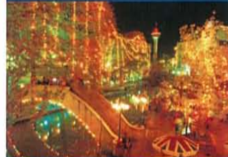
Relax on a cruise at the famous River Walk