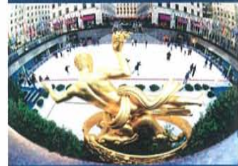
Explore amazing Rockefeller Center