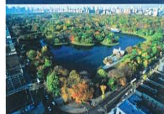
Visit famous Central Park