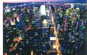
Guided Tour of New York City