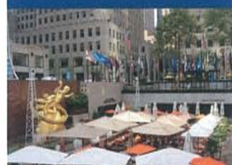
Explore amazing Rockefeller Center