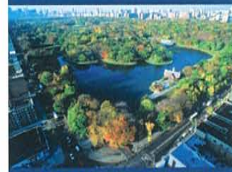
Visit famous Central Park