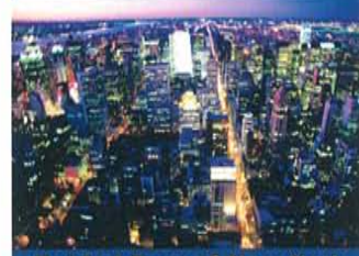
Guided Tour of New York City