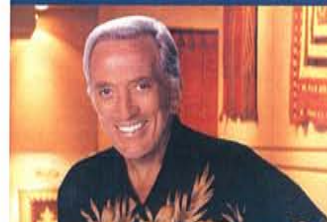
THE ANDY WILLIAMS CHRISTMAS SHOW

Day 7: After enjoying Breakfast, you'll depart for home... a time to chat with your friends about all the fun things you've done, the great shows you've seen, and where your next group trip will take you!