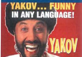
THE YAKOV SMIRNOFF SHOW