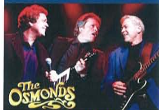
THE OSMOND BROTHERS SHOW