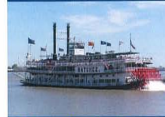
Enjoy a Riverboat Cruise