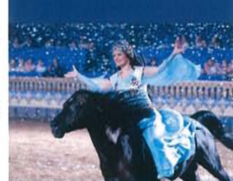
Arabian Nights Dinner Show