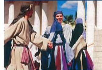
The Holy Land Experience